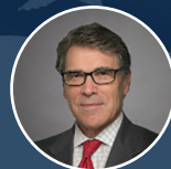
Rick Perry Chair, Center for Energy and the Environment