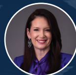
Brooke Rollins President & CEO