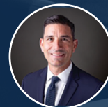
Chad Wolf Executive Director, Chief Strategy Officer & Chair, Center for Homeland Security & Immigration