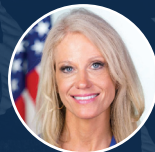
Kellyanne Conway Chair, Center for the American Child