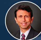
Bobby Jindal Chair, Center for A Healthy America