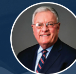
Gen. Keith Kellogg Co-Chair, Center for American Security