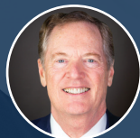
Robert Lighthizer Chair, Center for American Trade