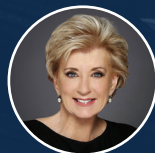
Linda McMahon Chair of the Board and Chair, Center for the American Worker