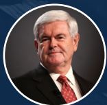
Newt Gingrich Board Member