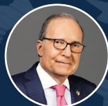
Larry Kudlow Vice Chair of the Board and Chair, Center for American Prosperity