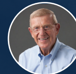
Lou Holtz Chair, Center for 1776