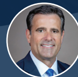
John Ratcliffe Co-Chair, Center for American Security