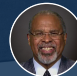
Ken Blackwell Chair, Center for Election Integrity